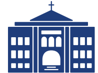
ST. BONIFACE Northside