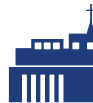
ST. FRANCIS DE SALES East Walnut Hills

Companion Scholars Program with high school mentors