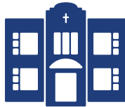
CORRYVILLE CATHOLIC Clifton Heights

Current principal is St. Joseph graduate