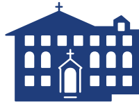
ST. FRANCIS SERAPH Over the Rhine

First Five Star preschool in Archdiocese