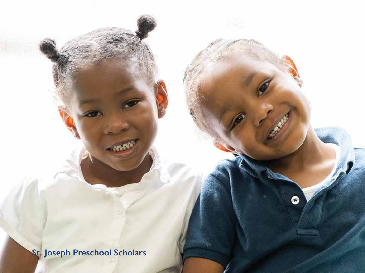
St. Joseph Preschool Scholars